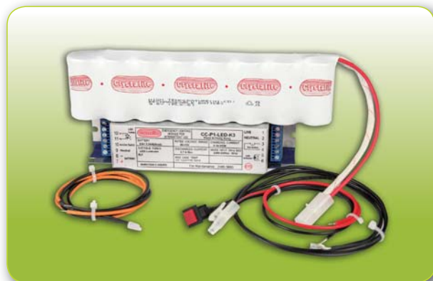
"CRYSTALITE" CAT. CC-PI-LED-K3